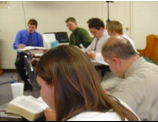
Baptist History Module

Section 13: Abortion - We believe that human life begins at conception and that the unborn child is a living human being. Abortion constitutes the unjustified, unexcused taking of unborn human life. Abortion is murder. We reject any teaching that abortion of pregnancies due to rape, incest, birth defects, gender selection, birth or population control, or the mental well-being of the mother are acceptable (Job 3:16; Psalm 51:5; 139:14-16; Isa. 44:24; 29:1,5; Jer. 1:5; 20:15-18; Luke 1:44).